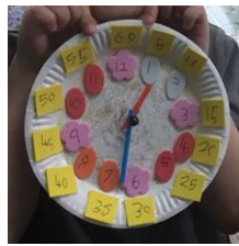
Ernie's clock – Yr 1