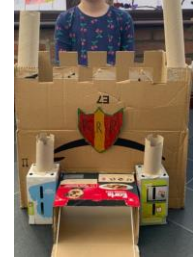
Castle Project – Yr 2