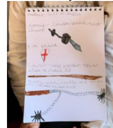
Castle Project - 2